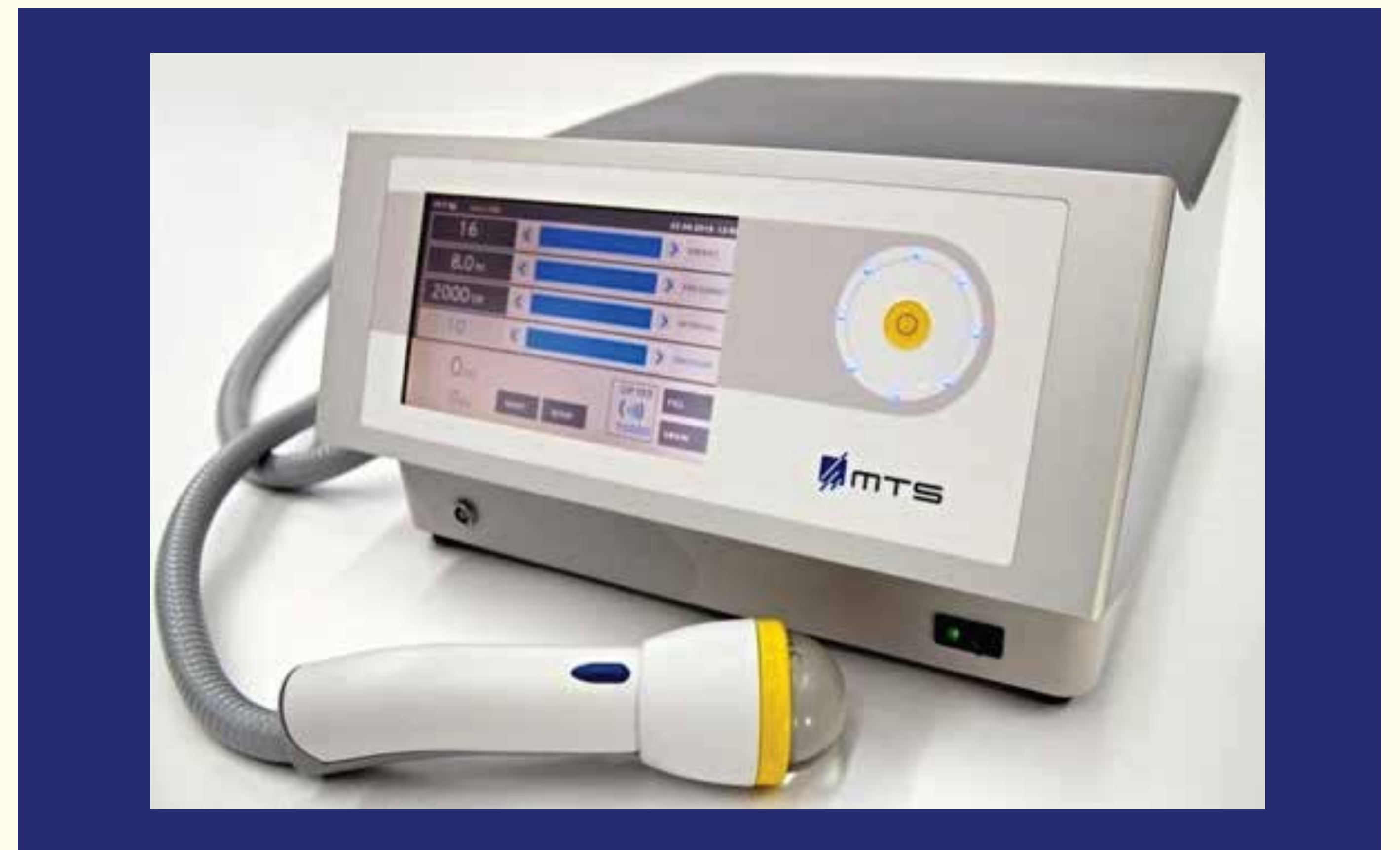
Figure 1: Urogold 100 device used in this study

Overall, SHIM score improved from 11.0 \pm 3.6 to 17.2 \pm 5.2 ( p = 0.01 ). SHIM was unchanged in 2 patients (25%), mildly improved in 1 patient but not sufficiently for intercourse and significantly improved with erection sufficient for intercourse in 5 patients (62.5%) ( figure 2 ). Two of these 5 men required a PDE5i for optimal erections however both had failed PDE5i in the past.